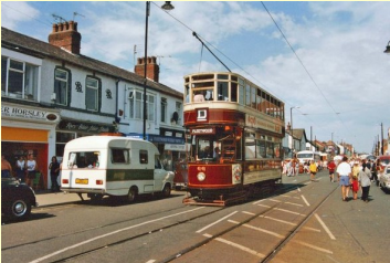
Fleetwood town in the past.