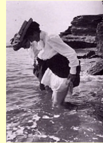
Victorian women having a paddle in the sea.

British people have been enjoying the seaside for hundreds of years. However seaside visits were fairly different to how they are today. In Victorian times, people couldn't go abroad because there were no planes so going to the British coast was very popular. In those days, sunbathing wasn't popular and instead people sea bathed. They would wheel out on 'bathing machines' and swim into the water. Victorian's would be fully dressed at the beach and if they were to swim they would wear long bathing costumes which covered their bodies. Nowadays people like to wear smaller swimming suits and enjoy sunbathing. Beaches are a lot dirtier now because we have more litter and wrappers. However some things never change and people have always enjoyed ice creams, walks along the pier and playing games on the beach.