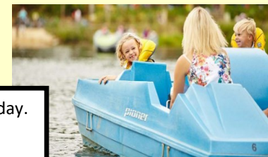
A Pedalo used today.