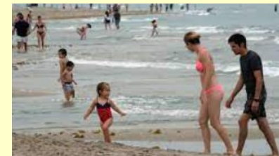
A family enjoying the beach today.