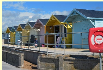
The beach huts on Fleetwood beach